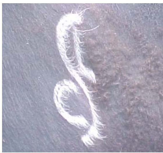
Although branding is not practiced by a very high percentage of Missouri livestock owners it can be a deterrent to theft for those who take the time to place a registered brand on their stock. Most thieves avoid stealing branded animals as they are more likely to be noticed by knowledgeable workers at livestock markets.