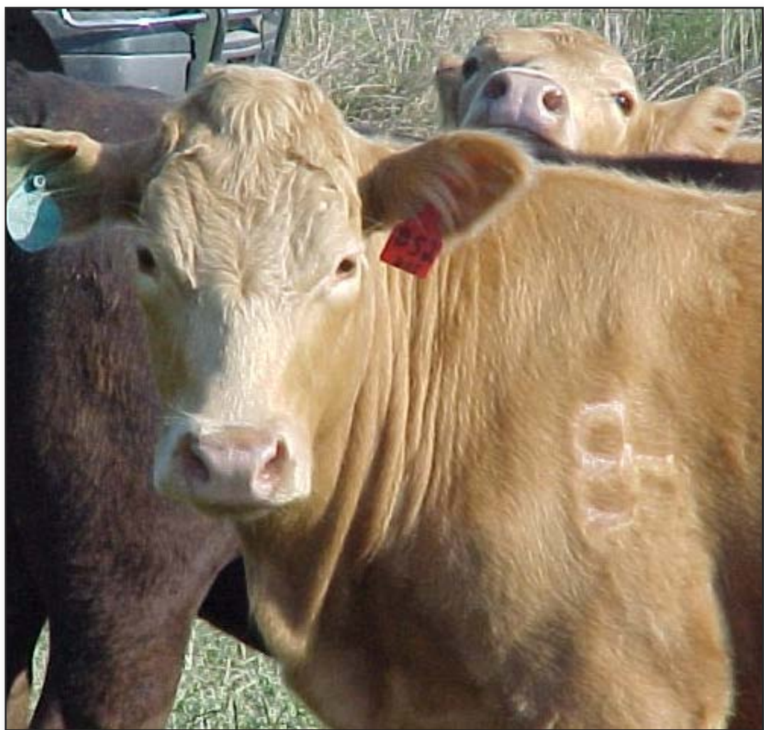
The brand may be by hot iron or freeze brand. It must contain two characters at least. The brand must be three inches or larger in diameter. Brands can be placed in six locations on the animal. They are the shoulder, rib or hip on each side of the animal.

county recorder of deeds, every livestock market and slaughter house in the state. Law enforcement officials may request them and many University of Missouri Extension Centers have